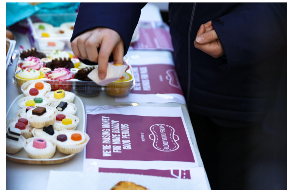
Bake sale success at Taverham High School!

P.S. Feel free to use our Bloody Good Fundraising Logo!